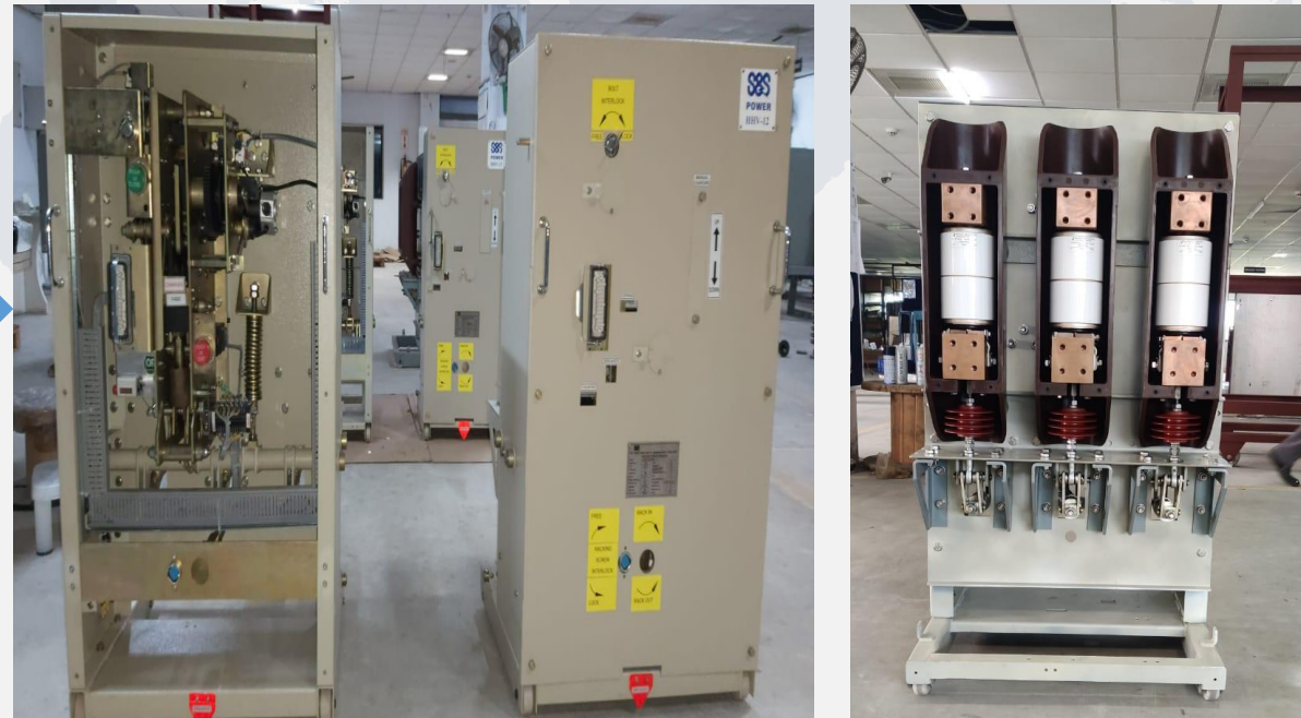
S&S - VCB (HHV12 PRIME)