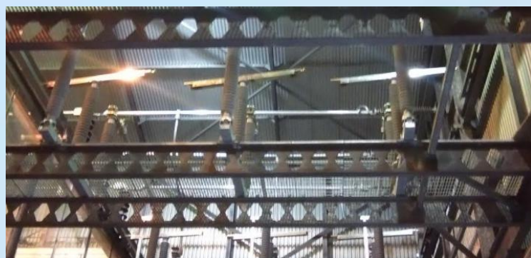
HAPAM Make Disconnector